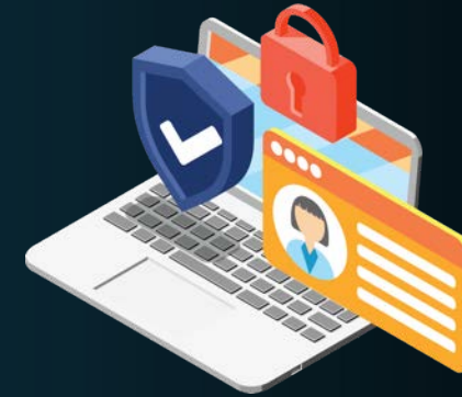
Trust & privacy