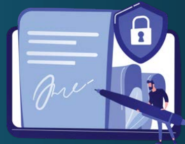
Right to privacy / consent