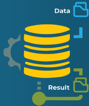
Garbage in Garbage out